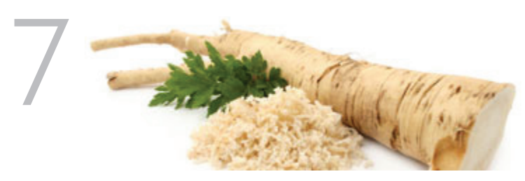
Why We Eat Horseradish at Passover

Every year, Jewish people gather in family dining rooms around the world to celebrate the Passover seder and remember God's redemption of Israel from slavery in Egypt. The seder is designed to involve all five senses in the retelling of the Exodus story to the next generation. As we celebrate, we imagine that we too were once slaves of Pharaoh in Egypt, because "if the Eternal God had not brought our forefathers out from Egypt, then even we, our children, and our children's children might still have been enslaved to Pharaoh in Egypt" (from the traditional Passover service).